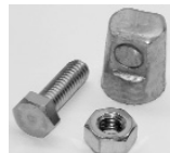
Universal Terminal (UT)