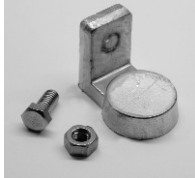
"L" Terminal (LT)