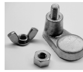
Wingnut Terminal (WNT)