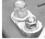
Embedded AP with Stud Terminal (EAPS)