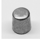
Automotive Post (AP)