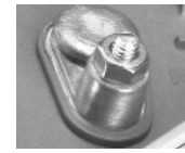
Embedded Low Profile Terminal (ELPT)

AVAILABLE FROM TROJAN MASTER DISTRIBUTORS WORLDWIDE